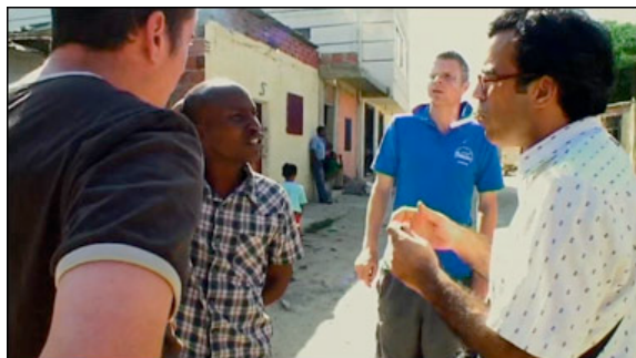
Hitting home ... the boys speak to ex-prisoners outside El Rodeo